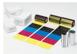
Ink Ribbon & Retransfer Film

*CX-D80 series is prohibited to export/re-export to Cuba, Iran, North Korea, Sudan and Syria by Export Administration Regulations of USA.